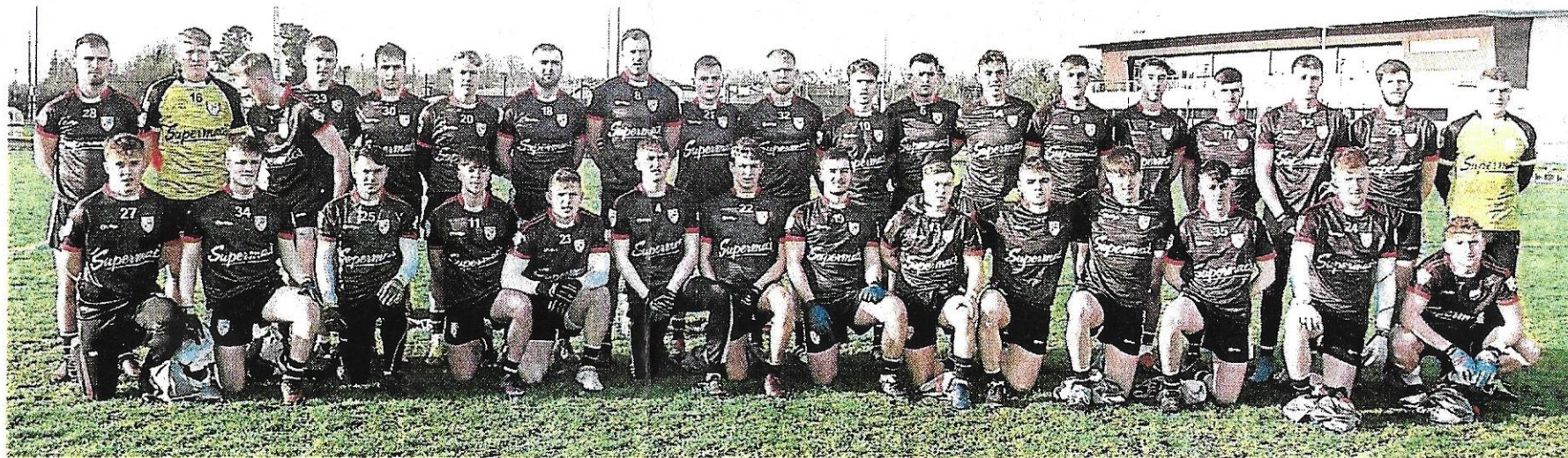
The Letterkenny IT side that beat IT Sligo at the weekend to qualify for the semi-finals of the Sigerson Cup.