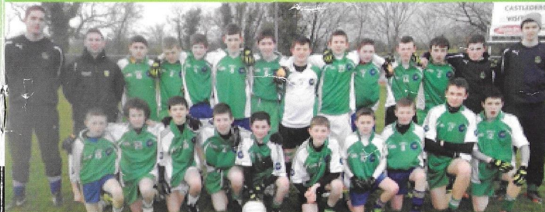
Back row L to R.