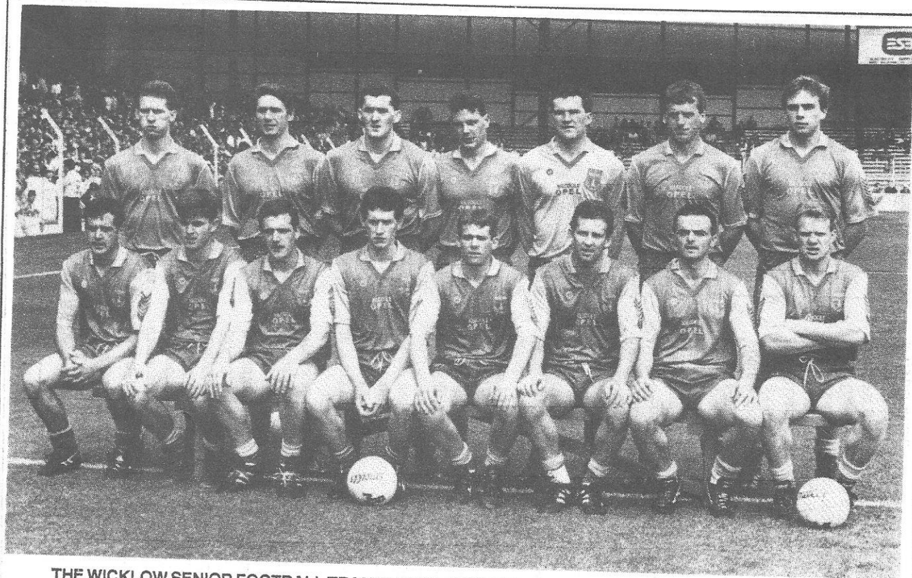
THE WICKLOW SENIOR FOOTBALL TEAM THAT PLAYED MEATH IN THE LEINSTER CHAMPIONSHIP, 1991