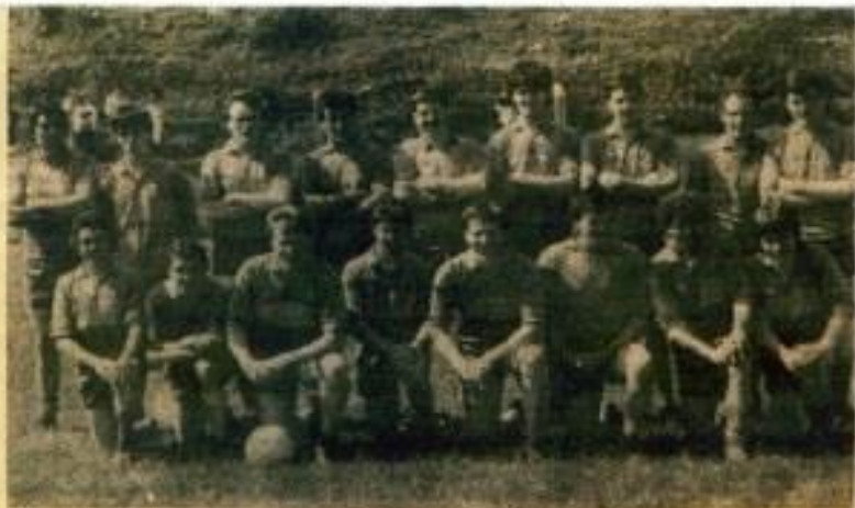
Kilmacshane, who beat Carndonagh in the Junior A Championship on Sunday.