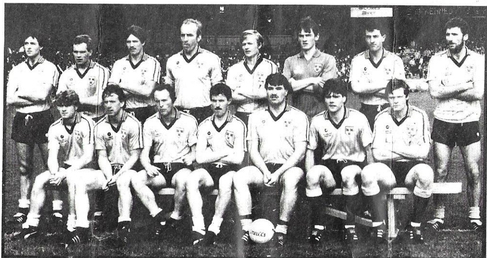
• The Dublin team which played Kerry in this year's All-Ireland final.