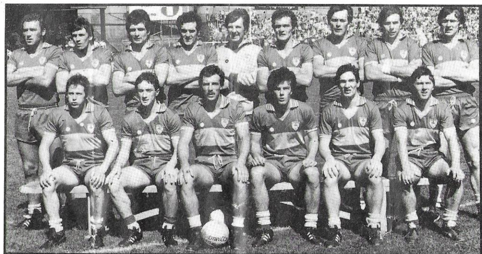
• The Donegal team which was defeated by Galway in the '83 All-Ireland semi final.