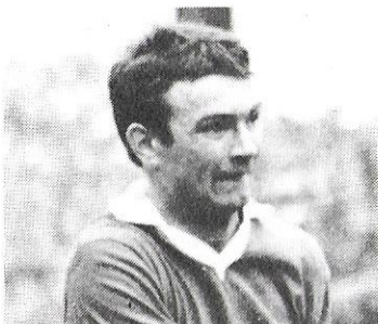
J. Barry Murphy.