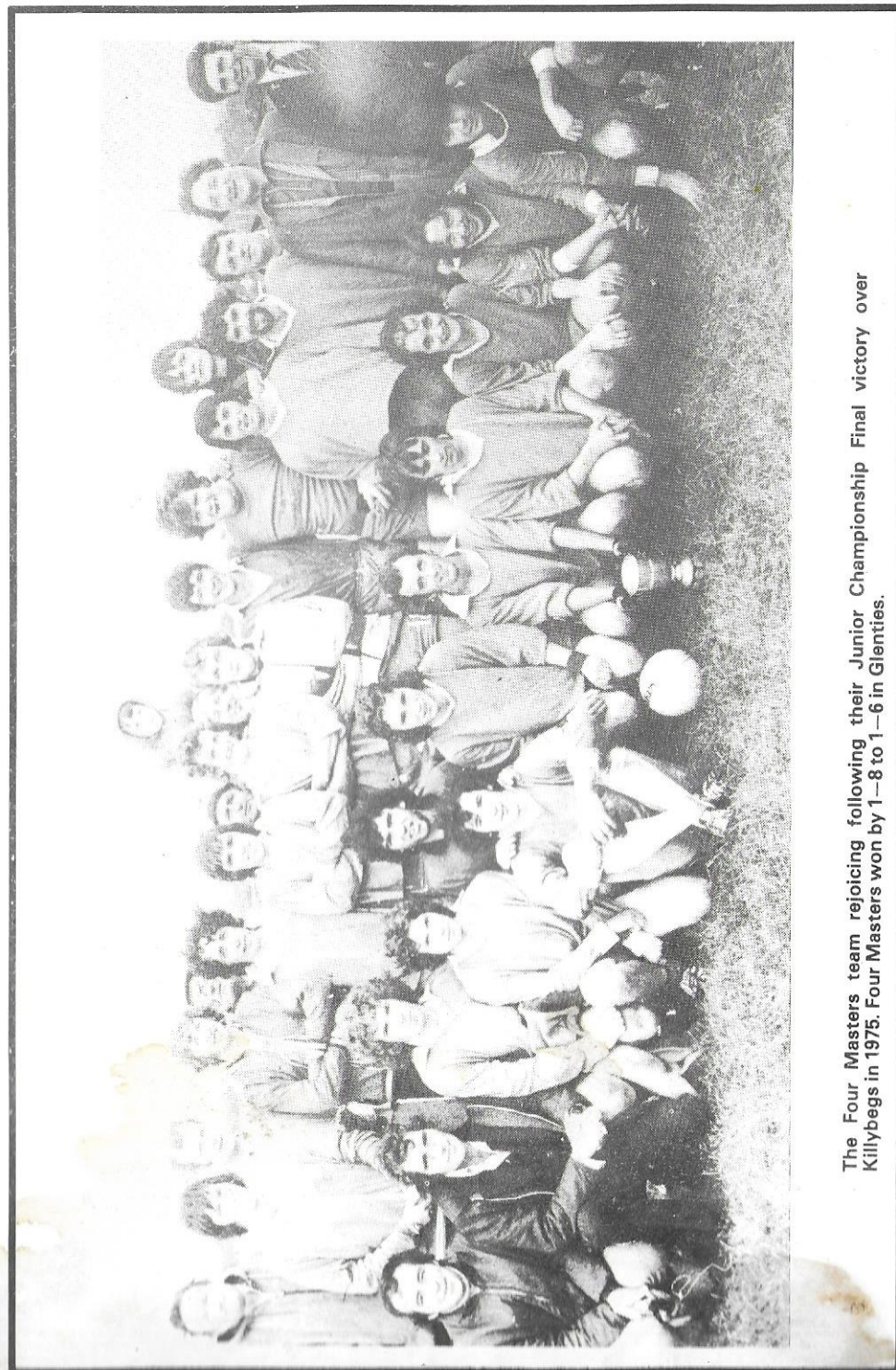
The Four Masters team rejoicing following their Junior Championship Final victory over Killybegs in 1975. Four Masters won by 1-8 to 1-6 in Glenties.