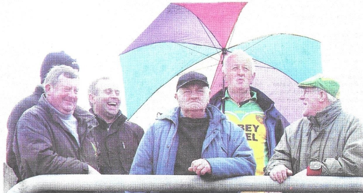
Donegal supporters at Sunday's game against Antrim.