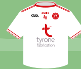
Padraig Hampsey (C) Oileán an Ghuail