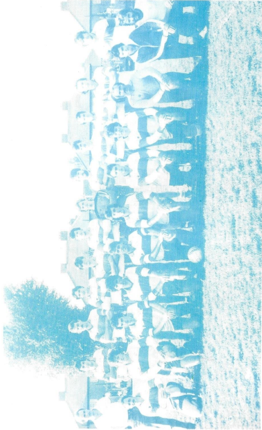
CÉAD MÍLE FAILTE TO TÍRCONAILL GAELS — LONDON SENIOR CHAMPIONS 1983