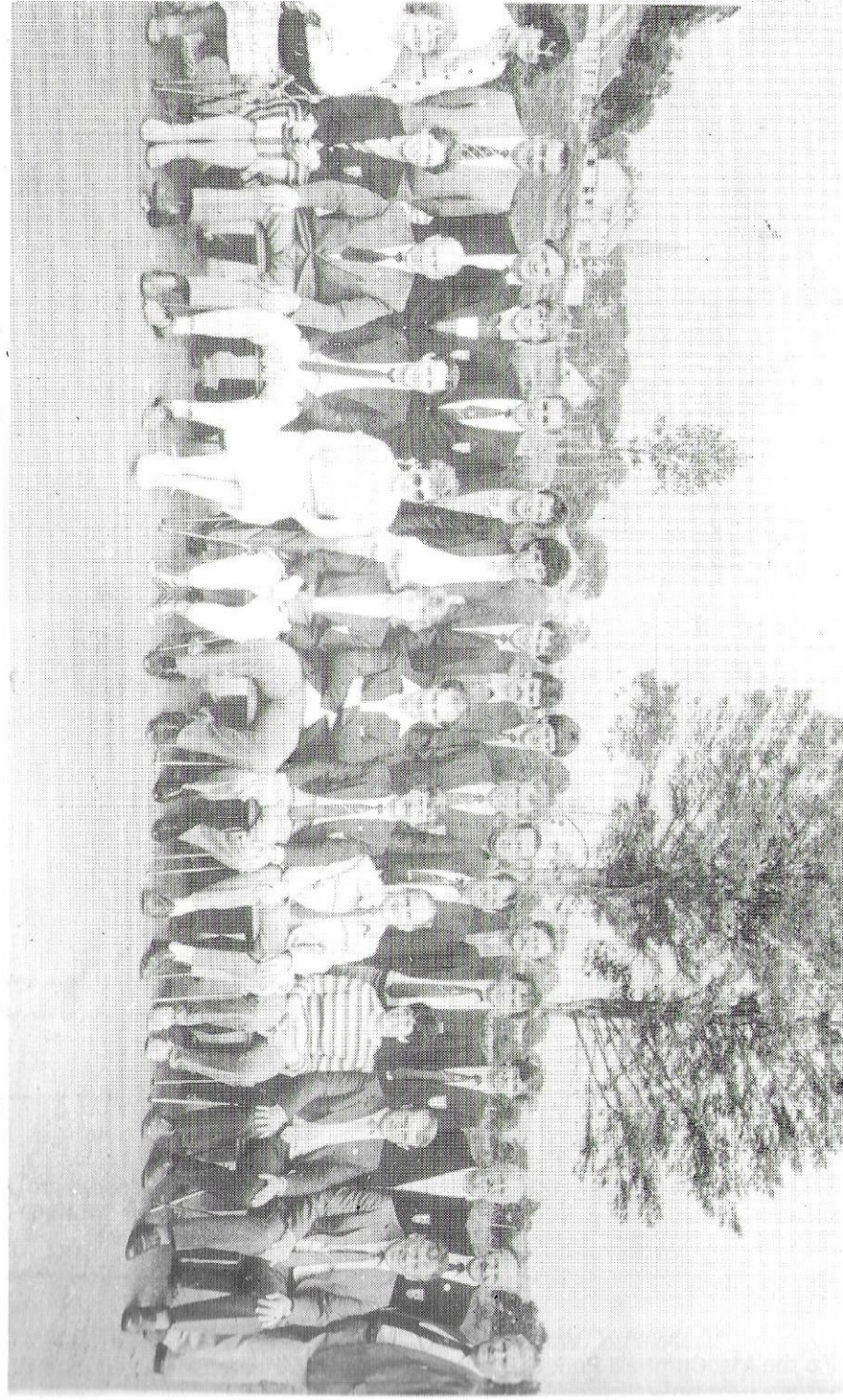
CÉAD MÍLE FAILTE TO THE NEW YORK G.A.A. TOURING PARTY