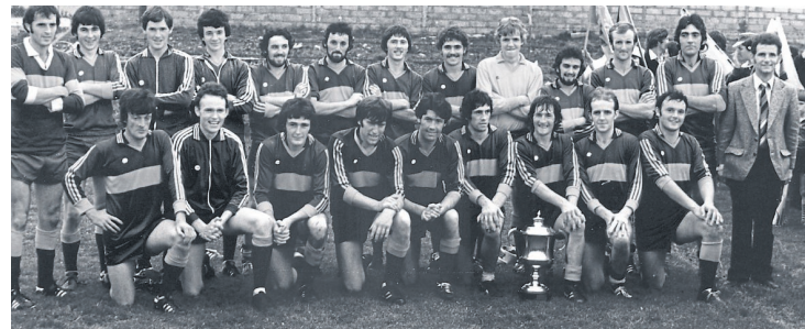
The Kilcar senior team of 1980