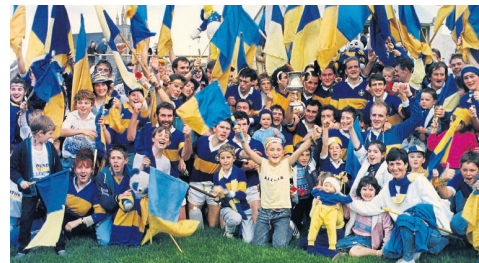
The victorious Kilcar side of 1989

of underage teams and was involved with the senior team in the early 1990s.